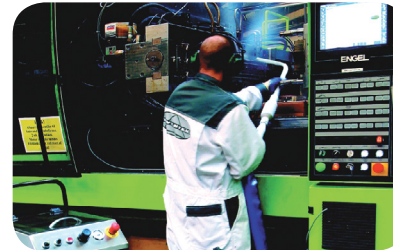
Maintenance - Machine Cleaning