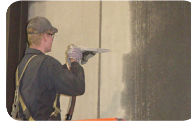
Fire Damage - Soot on Concrete