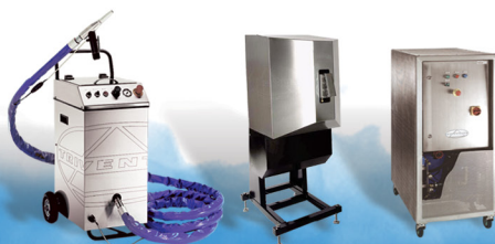
Dry Ice Blaster Pelletizer Recovery Unit

Wickens DRY ICE BLASTING 1-888-301-0044 www.WickensDryIceBlasting.com