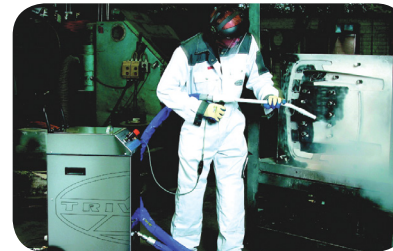
Industrial Mold Cleaning