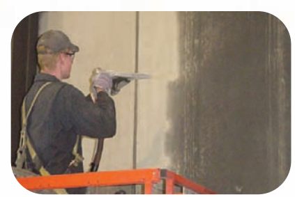
fire damage - soot on concrete

To join our e-newsletter list, watch video demonstrations, read testimonials and really see the difference Dry Ice Blasting makes, go online for a full resource of beneficial information or call one of our qualified staff today.