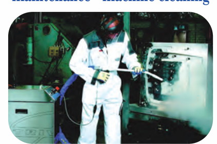
industrial mold cleaning